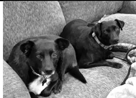
Turbo (left) and Athena (right)

Turbo and Athena were trapped on a local reservation. They were strays living on scraps and hand-outs given to them by customers of a busy gas station on the highway.