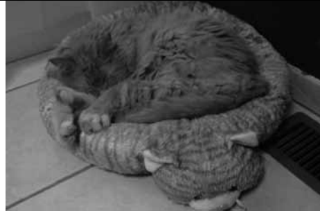
A warm bed inside

One late summer day, a teacher friend of mine texted me to tell me that two of her middle school students had lost their father after a long battle with illness. He had been feeding a homeless cat for seven years, but now the house was being sold in a few days and there was nobody left to take care of it. The kids were friends with the cat, and their mother was equally concerned, and they were looking for help. The neighbors had tried to catch the cat for years, but nobody could catch him. At this point, after being on the streets for so many years, the neighbors wanted the "dirty, ugly" cat gone.