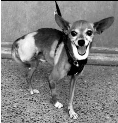
Roo fully recovered with fur missing from the failed skin graft.

Roo came to us after being surrendered to a Reservation Officer. He was living outside in miserable conditions. He had spent his long life outside in a small, filthy cage; he never experienced love, and he was never part of a family. In fact, he received so little attention that when his foot became infected, it went untreated. It eventually became so unbearable that he chewed his own foot off. He would have continued to suffer if not for the intervention of the Reservation Officer. Thanks to him, Roo will never be neglected again.