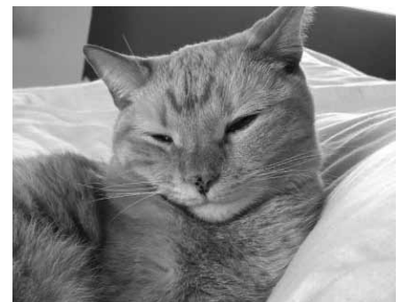
Mason at home