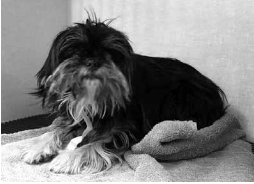
A recent FIX THE 505 success!

Despite struggles with funding, our FIX the 505 spay/neuter program continues to move forward in 2015. Our spay/neuter program for low-income households has so far helped 121 dogs/puppies. The recipients of the program are very grateful as nearly all live on fixed annual incomes of $20,000 or less. The number of animals we were able to help is down significantly compared to 2014 due to a decrease in funding (grants). However, donations from our dedicated donors have helped us forge ahead, and we will not give up on a mission that we consider "The Ultimate Solution" to end needless euthanasia in our city. Whether we spay/neuter 10 animals or 10,000 animals, we will continue this much needed program in