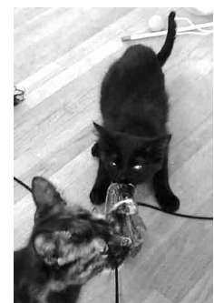
Jack and Mittens, lively kittens!