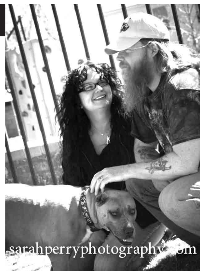
Mercy with her new family

After several surgeries and months of vet care, Mercy is mostly physically recovered. The emotional scars will take longer to heal. Her new