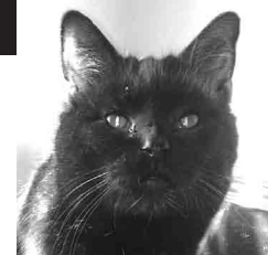
Big Brother Dante

All of these fantastic cats have now been spayed, neutered, and adopted into loving homes (with slightly fewer friends!). It is because of supporters like you that we were able to give these cats the vet care they needed. 11 cats on antibiotics is no small medication cost, and our donors came through. Without YOU we can't help animals like these, so PACA wants to thank each and every one of you for helping us help these animals, and the animals to come. Unfortunately, there will always be a need for us - and for you. THANK YOU for your support.