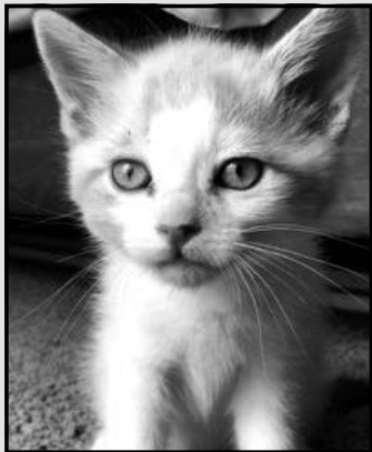
Corvus, one of the kittens adopted in 2020

DOG ADOPTION EVENTS ARE BACK! EVERY FIRST AND THIRD SATURDAY NEXT TO THE SPROUTS AT 6300 SAN MATEO.